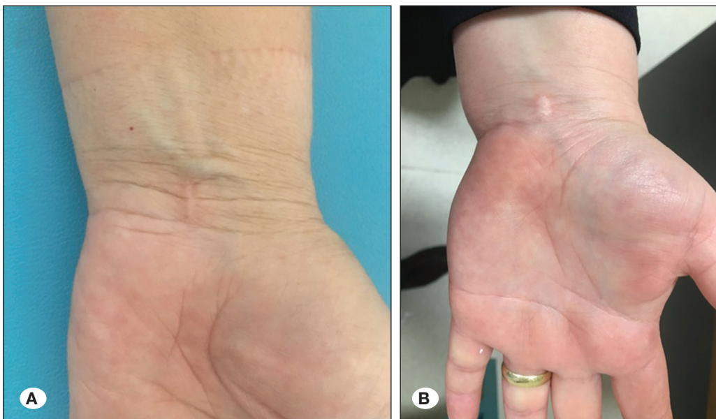
Figure 2: A) Incision scar. B) Patient in whom keloid formation was observed.

n: Number of patients; expressed as percentages within parentheses. McNemar test was used to compare the data.