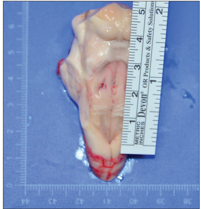
Figure 4: The sample image of brainstem and vertical measurement technique.

The knowledge of the external anatomy of the brainstem plays an important role in surgical planning, because of the correspondence between the external-internal structures and the anatomical landmarks on the brainstem. The morphology of the dorsal brainstem is also important in surgical approaches for the fourth ventricle tumors. The dorsal surface of the brainstem has an intraventricular portion, the rhomboid fossa, which is the floor of the fourth ventricle, and an extraventricular portion represented by the tectal plate and the cerebellar peduncles (14). The rhomboid fossa has the shape of a diamond and is delineated by the internal margins of the superior and inferior cerebellar peduncles. The lateral angles of the rhombus are closed by the middle cerebellar peduncles, the inferior angle is the obex, and the superior corner is marked by the frenulum of the superior medullary velum of the fourth ventricle (14).