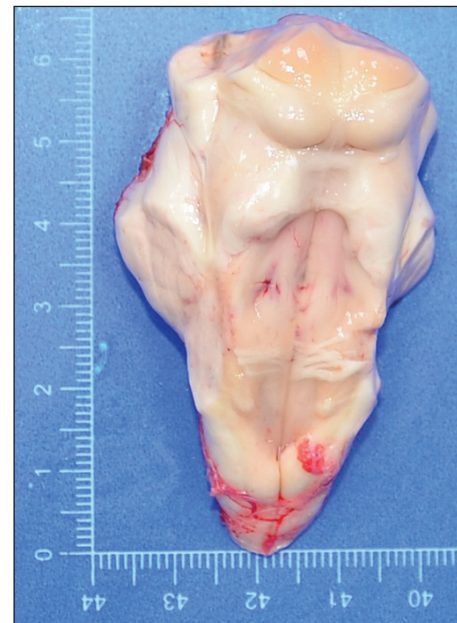
Figure 2: The photographic image of brainstem sampled from fresh cadaver.