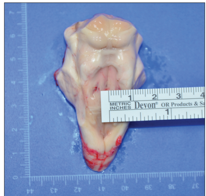
Figure 3: The sample image of brainstem and horizontal measurement technique.