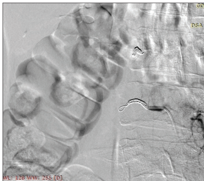
Figure 3: Tumor feeders from the abdominal aorta seem to be closed after selective arterial embolization.