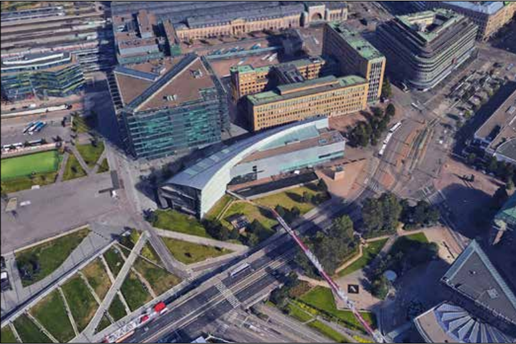
Figure 1: Aerial view of Kiasma Museum Helsinki.