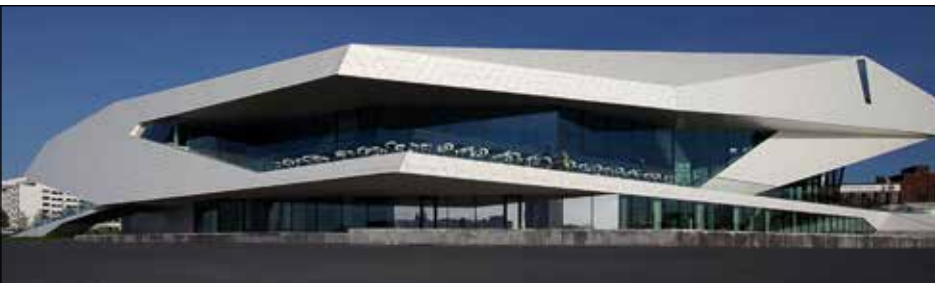
Figure 6: Front facade of the Eye Museum Amsterdam facing the river, resembling the form of a narrowed eye.

Human figure anatomy and senses, acting as a spectator, as an explorer of art and space, acting as a model for design, in one way or another, seem to get involved in this architecture.