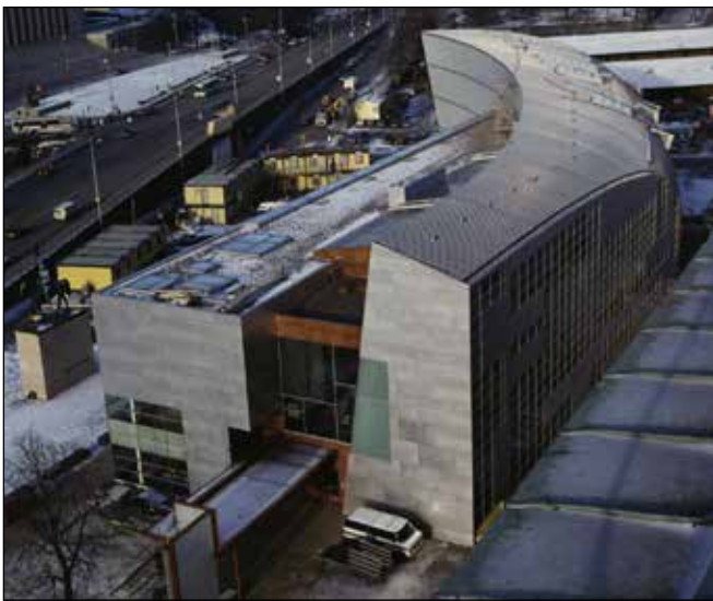
Figure 2: Entrance facade of Kiasma Museum Helsinki.

at the center of the plaza in west direction. Within the urban context of significant architectural, cultural references, Kiasma forms strong connections with its surroundings, both in means of volume and space and as a culture building, its layout embracing Helsinki's architectural legacy (6). The urban/cultural axes, building mass and landscape are intertwined.