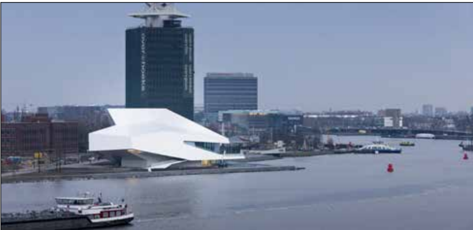
Figure 5: Eye Museum Amsterdam picture from a lateral view resembling an open eye figure with upper and lower lids.