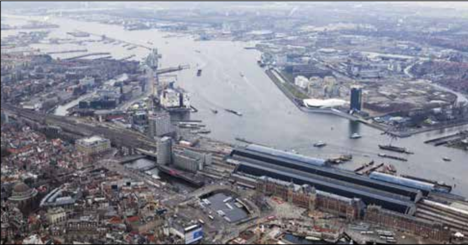
Figure 4: Eye Museum Amsterdam has been built as a part of the Urban Development Program on the north bank of the River IJ.