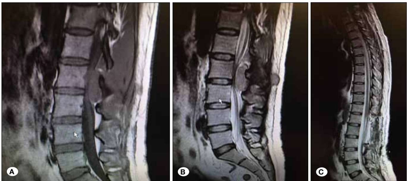
Figure 1: Magnetic resonance imaging (MRI) of the patient demonstrating a round epidural isointense in T1-weighted (A) and heterogeneously hyperintense in T2-weighted images (B) lesion compressing the conus medullaris posteriorly (L1-L2 levels); the postoperative T2-weighted image of the lumbosacral area demonstrating laminectomy of L1-L3 and total excision of the mass resulting in decompression of the conus medullaris and free CSF flow (C).