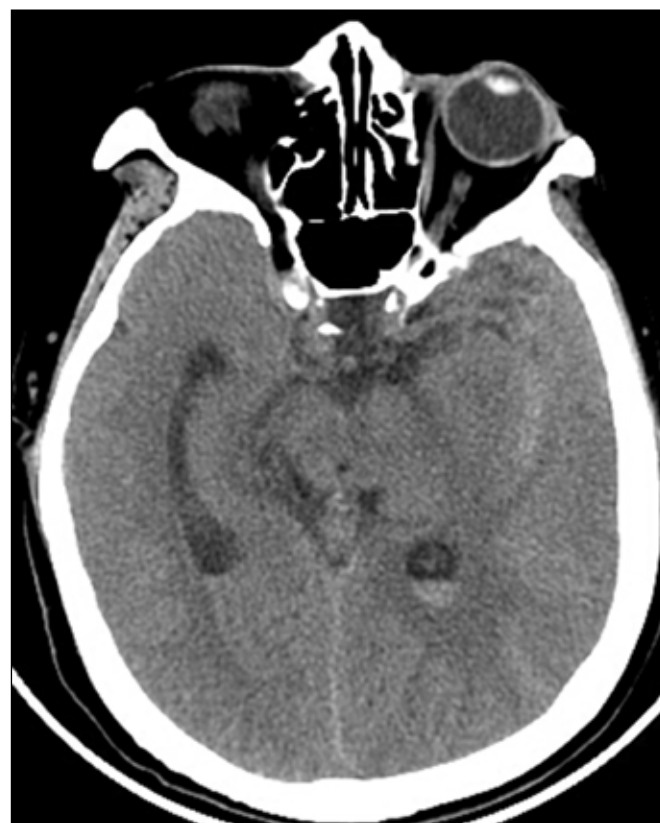
Figure 1: Head CT scan of a 62-year-old female indicating subarachnoid hemorrhage (SAH), located mainly at the left lateral fissure.

The degree of aneurysm occlusion was evaluated with DSA by two senior professional physicians immediately after the procedure, and then again, six months later. Modified Raymond classification was used to evaluate the patients