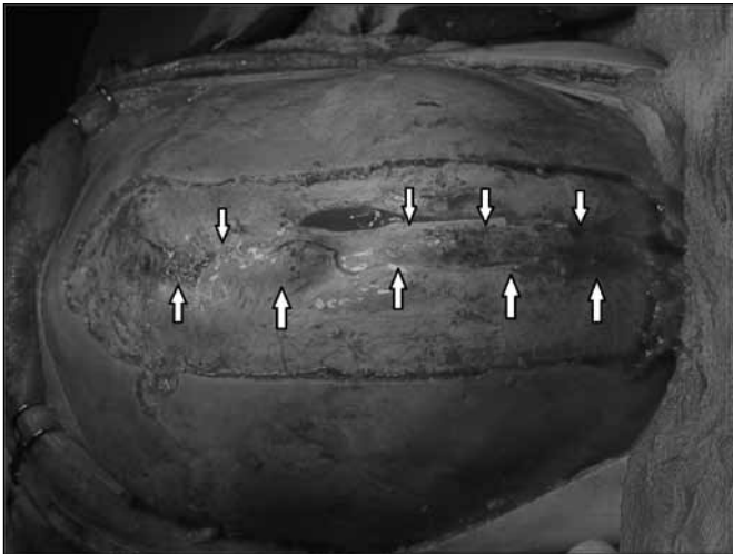
Figure 1: In infants, the dura overlying the (large) superior sagittal sinus (arrows) is thin and carries a potential risk of injury and excessive blood loss.

Many different techniques, from total calvarial re-modelling to minimally invasive strip craniectomies, are used in the surgery for sagittal synostosis (3,5,6,7,9). The common feature of most described surgeries is the removal of the prematurely fused sagittal suture (2). This traditional midline craniotomy consists of the following: dissecting the periosteum over the suture at the anterior fontanel, bilateral parasagittal bone cuts using a craniotome, and elevation of the midline separating the dura from the undersurface of the bone over the superior sagittal sinus from the anterior to the posterior fontanel with coagulation of the emissary veins under the elevated strip bone (1,8). In infants, the superior sagittal sinus lies underneath the entire midline synostotic parietal bone to be removed. Because of the thin and fragile dural sinus leaf, the