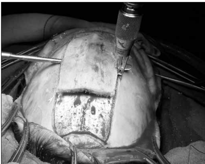
Figure 3: Removal of the midline one-third of the bone safely freed from the underlying dura and superior sagittal sinus.