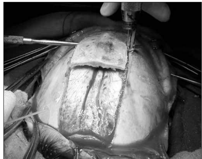
Figure 4: Removal of the posterior one-third of the bone freed from the sinus using an elevator.