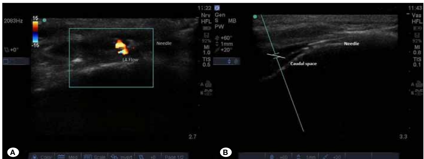
Figure 1: A,B) USI of the caudal space and distribution of the injected solution (HFL 38x/ 13-6 MHz Transducer Bothell WA, USA).

Statistical analysis was carried out using the Statistical Package for Social Sciences (SPSS) version 17.0 software for Windows (SPSS Inc., Chicago, IL, United States). The values of continuous variables were given as mean (standard deviation) and nominal variables were expressed as the number of cases and percentage. Statistical analysis was performed