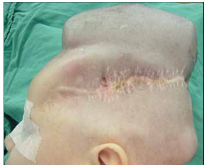
Figure 1: A decompressive craniectomy patient had a composite defect involving skin for which tissue expansion was carried out.

Patient's head was positioned laterally on a silicone headrest under general anesthesia leaving craniectomy defect up. Scalp was prepared with povidon-iodine solution and draped properly. A 4 cm long oblique incision was made 4-5 cm posterior and superior to the posterior border of craniectomy incision line, and then the galea was dissected from periosteum. A tissue expander prefilled with 20 ml saline and its pump was placed underneath scalp and propelled to vertex. The procedure was completed following skin closure. Patients were assessed weekly in outpatient clinic for three-months and the pump was filled with additional 20 ml saline on each visit (Figure 1).