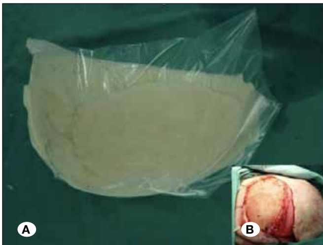
Figure 3: A) The mixture is placed into the mold. B) Intraoperative view.