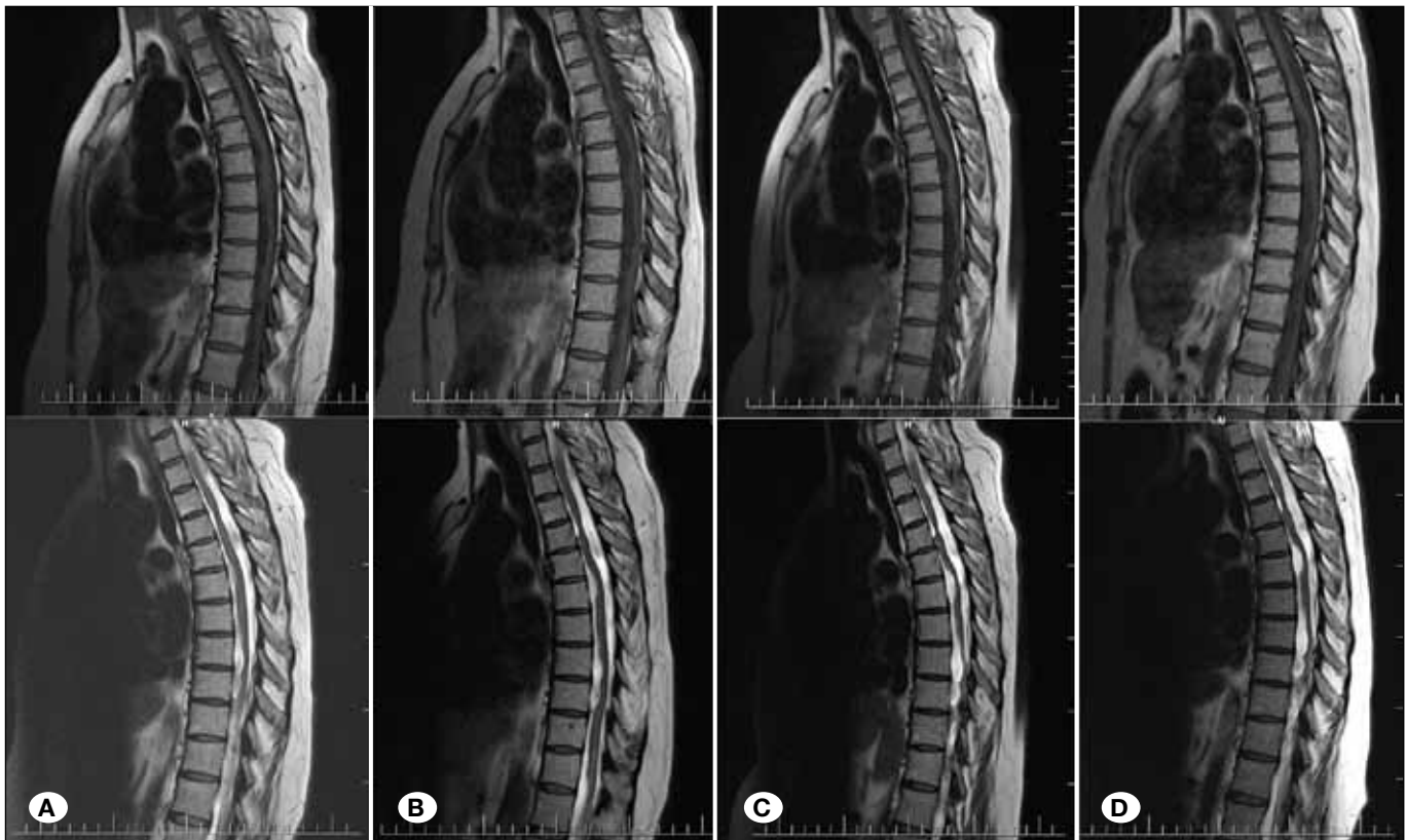
Figure 2: Thoracic MRI (T1 and T2 weighted sagittal sequences). A) Sequel hemorrhage between T6-T9 especially anterior to the cord. B) Cystic cavitation in the anterior subarachnoid space of T3-4, T5-6 and T8-9 at the third month. C) Cystic expansion in the anterior subarachnoid area at the level of T3-4, T5-6 and T8-9 and indentations to the cord at the 8 month and D) no further changes at the 19 month.