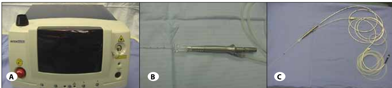
Figure 2: The laser source (A) and handpiece (B,C) for PLDD are shown in this picture.

Of the 197 patients, 107 (54.3%) were male and 90 were female with a mean age 46.34 years (range 23 to 86 years). The average pre-procedure VAS score was 6.3 (range 4 to 7). Among the 72 patients, the level of PLDD was L3-L4 in 4 patients, L4-L5 in 39 (54.2%) patients and L5-S1 in 29 patients. L4-L5 and