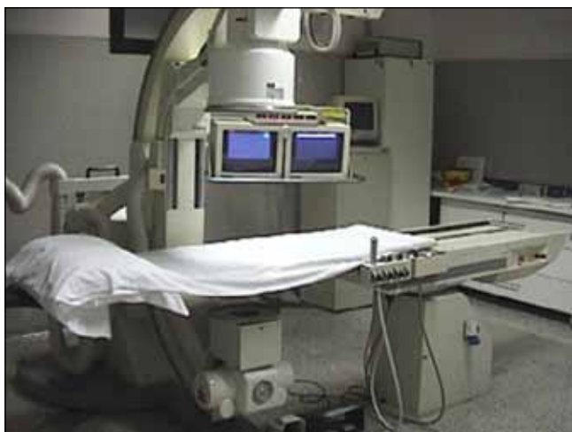
Figure 1: The operating room design and C-arm fluoroscopy for PLDD procedure.

Written informed consent about the treatment protocol was obtained from all patients before the procedure. A total of 197 (0.02%) patients among the 79979 patients underwent PLDD treatment between 2007 and 2009. Of the 79979 patients, 9541 patients presented to neurosurgery, 29360 patients presented to physical therapy, 19550 patients presented