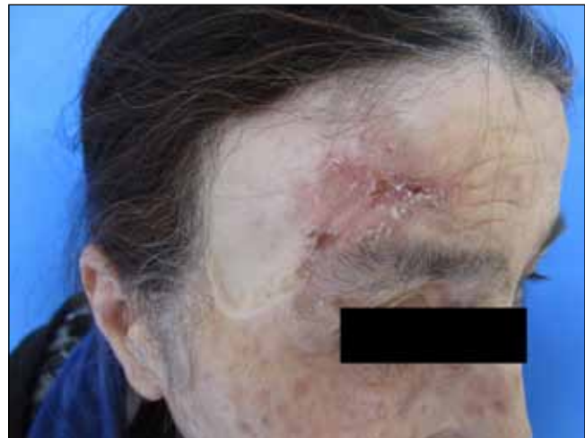
Figure 2: More closer view of the same patient with BCC in the frontal region.