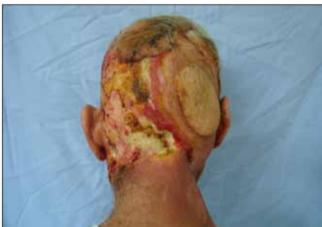
Figure 11: Postoperative posterior view of the same patient. The defect closed with latissimus dorsi myocutaneous flap.

observed in 2 of 5 patients, who underwent reconstruction with a free tissue flap, and then 2 patients were re-operated to renew anastomosis; as a result, no flap loss occurred. Three of 4 patients undergoing reconstruction with latissimus dorsi flap suffered a seroma in the donor area. Fortunately, all donor areas were cured without any complication at the end of a 2-week observation period.