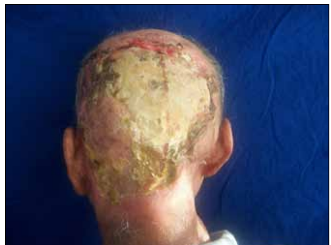
Figure 8: Preoperative posterior view of the patient with SCC.