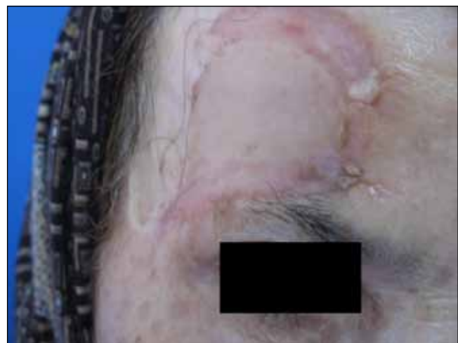
Figure 4: More closer view of the same patient, reconstructed with graft.