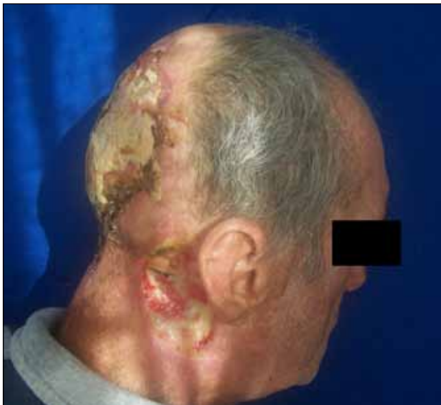
Figure 10: Postoperative lateral view of the same patient.