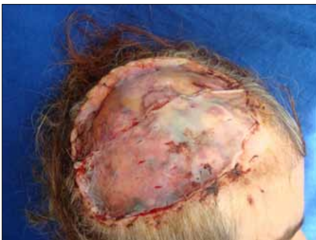
Figure 7: Postoperative view of the patient with SCC in the parietal region, reconstructed with graft.