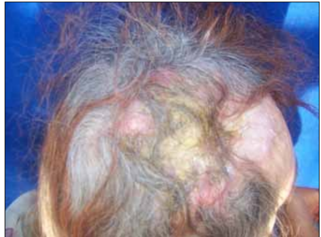
Figure 6: Preoperative view of the patient with SCC in the parietal region.