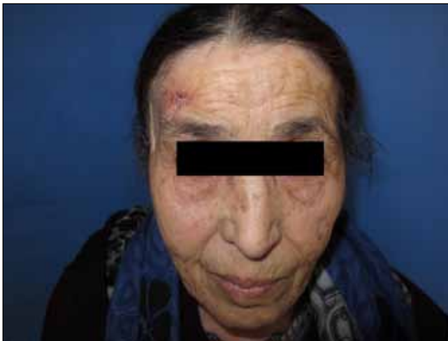
Figure 1: Preoperative view of patient with BCC in the frontal region.

SCC; Squamous Cell Carcinoma, BCC; Basal Cell Carcinoma.