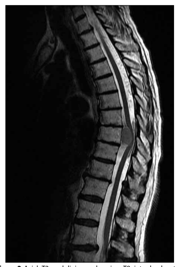
Figure 2: Axial T2 gadolinium-enhancing T8 intradural extramedullary mass. Note extensive compression of thoracic spinal cord in canal (approximately 5 o'clock).