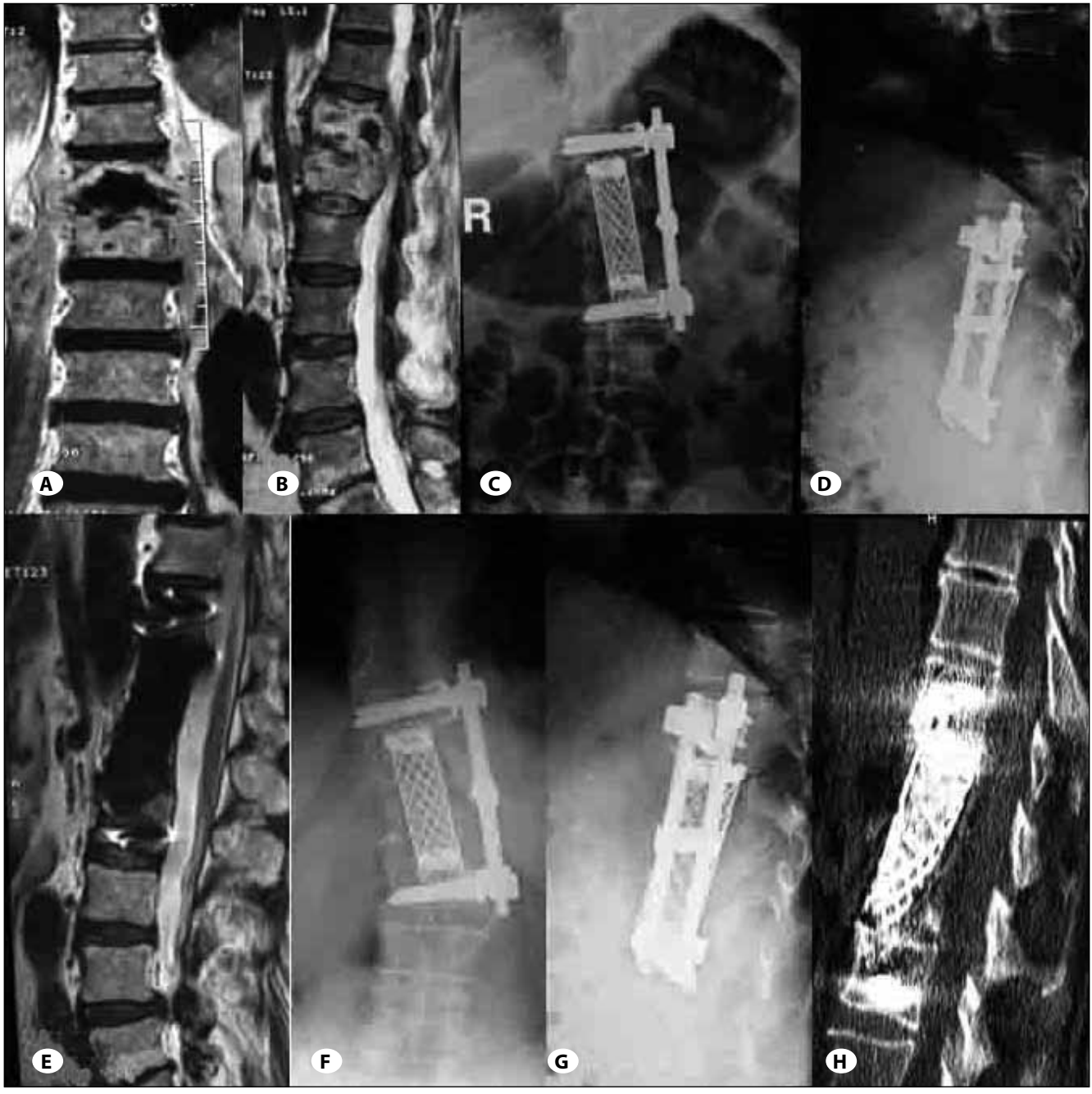
Figure 3: 63 year-old male with T12/L1 spinal tuberculosis and mild osteoporosis. A ) and B ) Preoperative MRI revealed destruction of the T12 and L1 vertebra, a large left psoas abscess and epidural abscess causing compression of spinal cord. C ) and D ) Immediate postoperative radiographs demonstrating anterior radical debridement, placement of a titanium mesh cage T11-L2 and dual-rod anterior instrumentation. E ) Immediate postoperative MRI revealed adequate decompression of the spinal cord. F ) and G ) Plain radiographs at 6 years revealed subsidence of the cage 3mm into the cephalad endplate and 13mm into the caudal endplate with a decrease of intervertebral height of 16mm and an increase in kyphotic angle of 6°. The scoliosis was measured at 16°. H ) Sagittal CT reconstruction demonstrated a solid fusion around the cage.