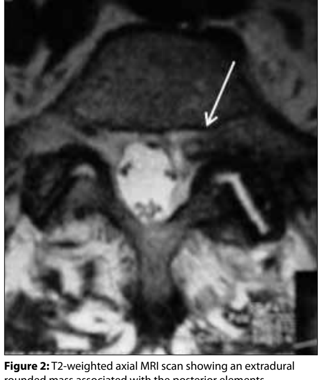
rounded mass associated with the posterior elements.

The left L5-S1 facet joint was exposed. L5 hemilaminotomy was performed, and TC and SEL were removed totally. Adequate neural decompression was achieved. The patient's