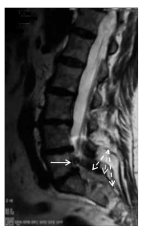
Figure 1: T2-weighted parasagittal MRI scan showing a mass posterior to the spinal canal associated with the posterior elements (arrow). Preoperative diagnosis was a synovial cyst. Epidural lipomatosis in the spinal canal (dotted arrows).