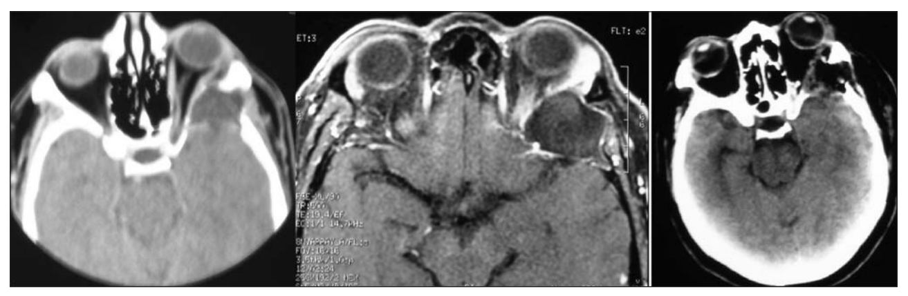
Figure 2: A. Preoperative axial CT scan showed marked erosion over the greater wing of left sphenoid bone due to temporal arachnoid cyst, B. Gadolinium enhanced axial T1-weighted MR image revealed minimal peripheral rim enhancement, C. Postoperative axial CT scan showed the lodge after removal.