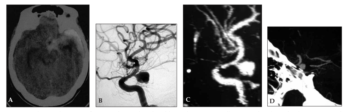
Figure 2: A) Cranial CT scan of Case 10 shows subarachnoid hemorrhage in suprasellar, interpedincular and Sylvian cistern and subdural blood collection on the surface of the left temporal lobe, B ) The angiogram reveals a large mid-carotid artery aneurysm with a narrow neck, C ) and D ) CT angiograms of the same patient show a large left IC-PC aneurysm with similar characteristics.

15,16,19). Prior to the era of CT, acute sSDH secondary to rupture of an intracranial aneurysm was diagnosed both at angiography or autopsy. Since the condition is frequently rapidly fatal, the reported incidence in autopsy studies (7,15) (10-22%) is higher than in clinical studies (3,9,13,14,16) (0.5-7.9%). Our experiences tend toward the middle of these two figures at about 1.6%. Acute sSDH in our series were found with aneurysms in various portions of circle of Willis: 5 IC-PC, 3 MCA, 2 AComA, and 1 ICA bifurcation. Four mechanisms for the development of acute sSDH due to ruptured aneurysms have been proposed (2,4,11,16,18). First, successive small bleeding episodes cause adhesion of the aneurysm to the adjacent arachnoid membrane, and the final rupture occurs into the subdural space. Second, a hemorrhage under high pressure may lead to pia-arachnoid rupture. Third, the arachnoid membrane is ruptured by rapid accumulation of blood under pressure from the leaking aneurysm. Fourth, erosion of the cavernous sinus wall by acute enlargement of the intracavernous aneurysm after thrombosis