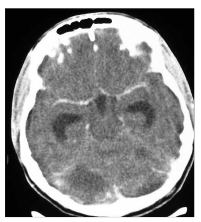
Figure 1: Axial CT image demonstrates hypodense foci with slightly rim enhancement by contrast along the tentorium and development of hydrocephalus.