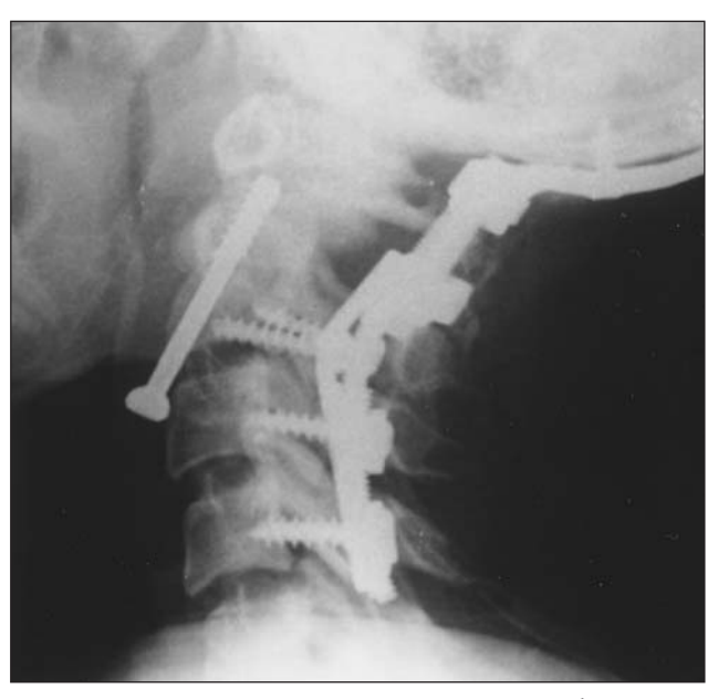
Figure 5: Lateral cervical roentgenogram of the patient after occipitocervical fixation.