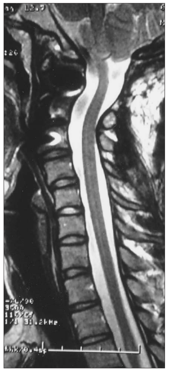
Figure 6: Sagittal T2-weighted cervical MRI shows decompression of the spinal cord three months after the second operation.