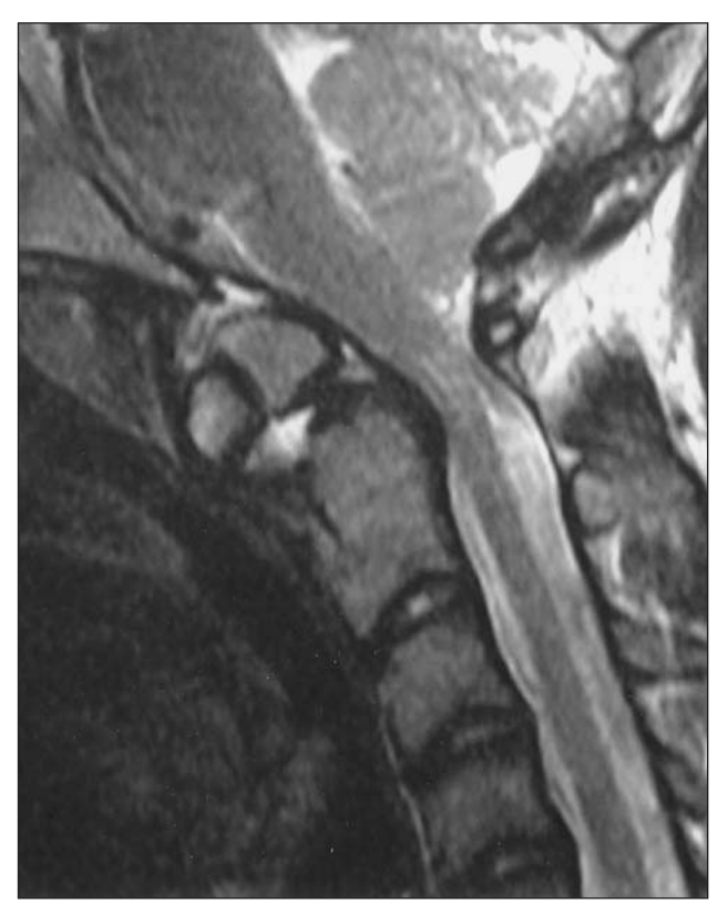
Figure 2: Preoperative T2-weighted sagittal cervical MRI of the patient in flexion position.