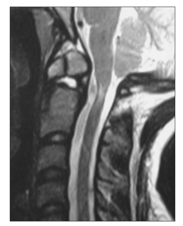
Figure 1: Preoperative T2-weighted sagittal cervical MRI of the patient.

compression, cervical MRI revealed an os odontoideum with myelomalasia in the spinal cord at the C1-2 level and syringomyelia at the T3 level (Figure 1). Dynamic (flexion and extension) lateral cervical x-ray films and MRI were performed. The distance between anterior edges of atlas and C2 had increased to 14 mm on lateral X-ray films. The anterior dislocation of os odontoideum with atlas and the compression of the spinal canal by the posterior arcus of atlas resulting in myelomalasia of the spinal cord were observed at sagittal T2weighted flexion MRI (Figure 2). Anterior odontoid screw fixation was performed on an elective basis taking into consideration that os odontoideum dislocates with atlas (Figure 3). In the control examination 3 months after the operation, she was still suffering from pain and her dynamic MRIs showed that compression of the spinal cord persisted (Figure 4). Thus the patient was operated on again and the posterior arcus of atlas was resected. Occiputo- cervical plate-screw fixation and autologous bone graft fusion was also performed (Figure 5). In the control examination 3 months after the second operation, the patient was completely free from pain and her MRI showed total decompression of the C1-2 (Figure 6).