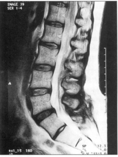
Figure 2: A postoperative T2-weighted axial image shows hyperintense mass with a hypointense rim in the left dorsolateral region of the spinal canal at L5-S1 level (a); and a postoperative T2-weighted sagittal image confirms total removal of the mass (b).