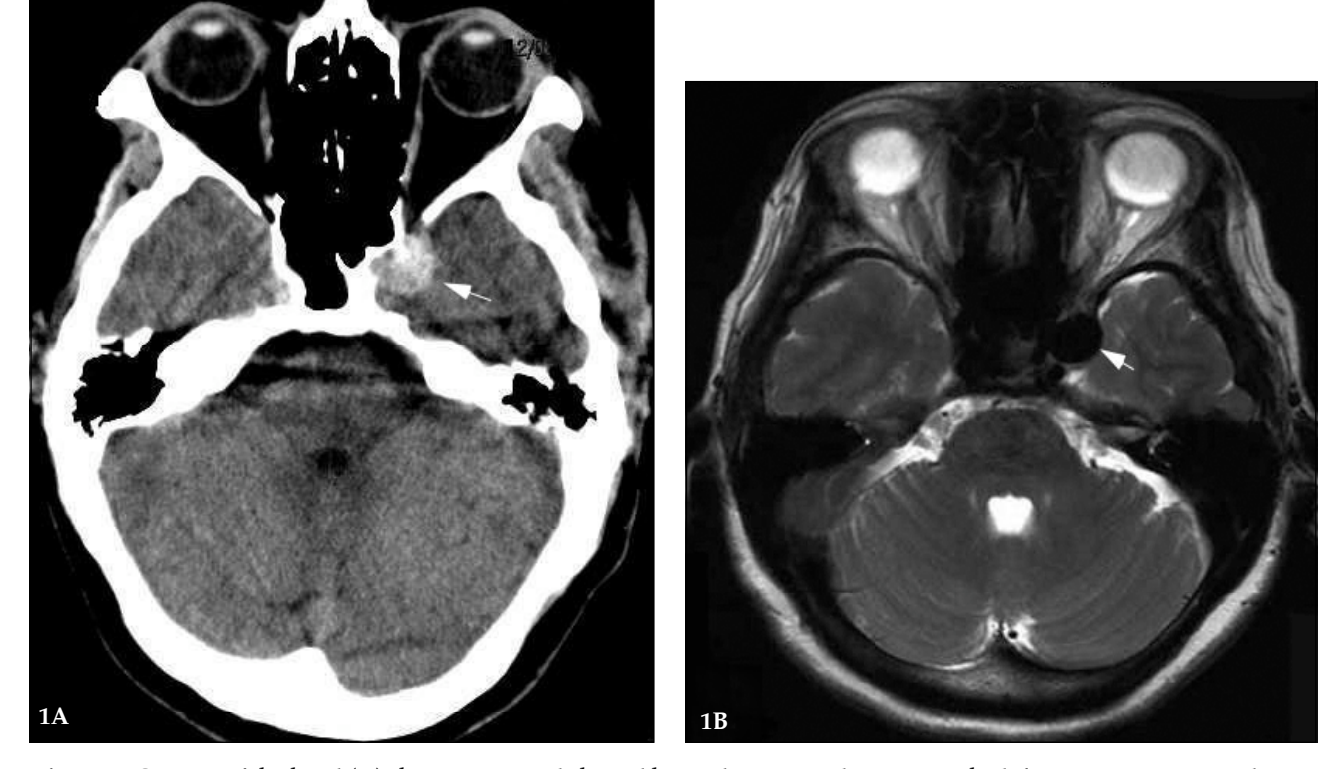
Figure 1: CT scan of the head ( A ) showing an oval shaped hyperdense mass lesion near the left cavernous sinus and MRI ( B ) disclosed a large left ICA aneurysm with 1.5 cm in diameter (arrows).

Technical developments in diagnostic tools, operating microscope, microvascular suture materials and an extensive understanding of cerebral vascular territory anatomy have allowed the development of bypass procedures. After an international randomized trial that reported STA-MCA bypass was not superior to medical therapy for t reatment of ischemic cerebral diseases (22), the number of these procedures has decreased dramatically over the years. However, it is now wellknown that cerebral revascularization is an important procedure in the treatment of complex intracranial aneurysms, cranial base tumors and some occlusive diseases. STA-MCA bypasses would be helpful in cases in which major vessel occlusion is required leading to interruption of the blood flow to the distal middle cerebral vasculature, and recent cadaveric (8, 9, 20, 21) or clinical publications (2, 6, 7,