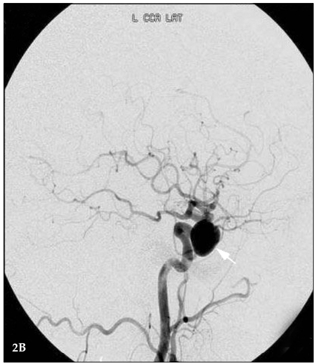
Figure 2: MR-angiography ( A ) and cerebral angiography ( B ) showed that the aneurysm originated from the cavernous and supraclinoid segment of the left internal carotid artery (arrows).