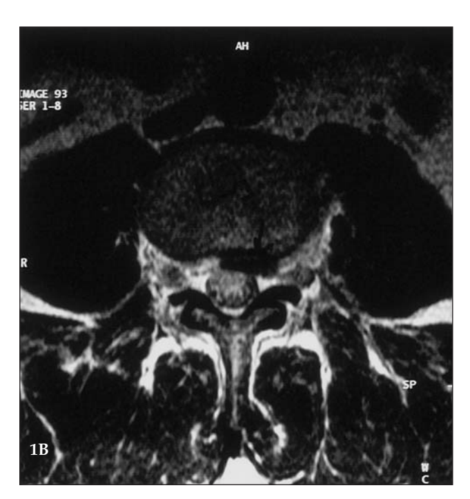
Figure 1A, 1B: The sagittal and axial MR images show compression of the left L4 nerve root. The preoperative radiological diagnosis was a herniation of L3-4 disc.