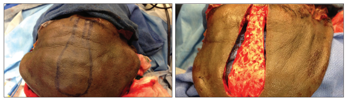
Figure 3: Intraoperative picture of flap preparation.