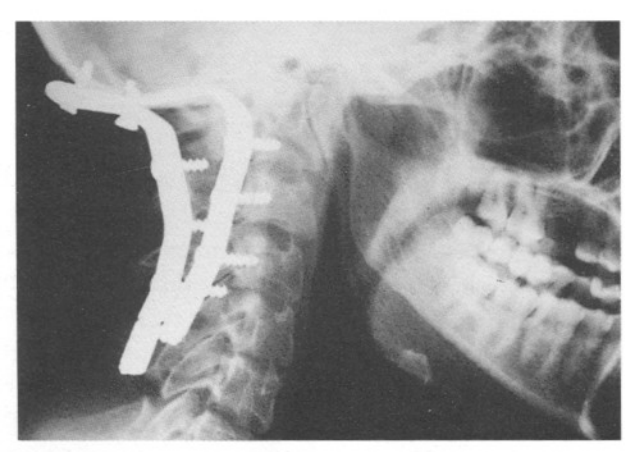
Fig. 2 : Lateral craniocervical x—ray demonstrating posterior horseshoe plate screw fixation.

approach to the occipitocervical region necessitates the use of posterior occipitocervical instrumentation because of the lack of anterior fixation techniques and the high complication rate seen with the use of bone grafts without instrumentation, i.e., non-fusion, infection, and resorption.