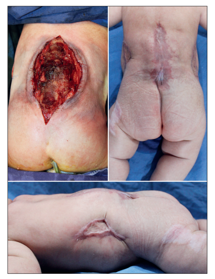
Figure 4: (Patient 10) A newborn presented with thoracolumbar meningomyelocele. An intra-operative view showing that the defect measured 8 x 13 cm, with a defect size of 104 cm<sup>2</sup>. The donor site was closed with a split-thickness skin graft (top-left). Final view shows good coverage 12 months after surgery (top-right). Stable wound healing of the donor area is demonstrated (below).

cm. Therefore, we recommend that the donor site be repaired with a skin graft for defects larger than 5 cm.