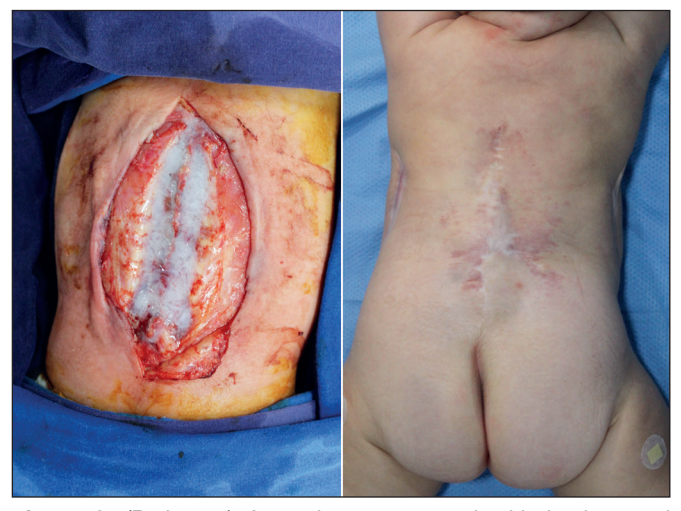
Figure 3: (Patient 5) A newborn presented with lumbosacral meningomyelocele. An intra-operative view showing that the defect measured 7 \times 10 cm, with a defect size of 70 \text{ cm}^2 . Primary closure of the donor site (left). Final view shows good coverage 16 months after surgery (right).

* Succesfull wound healing after debridement and primer suturation; **Succesfull wound healing after debridement and transposition of superior based fasciocutaneous flap.