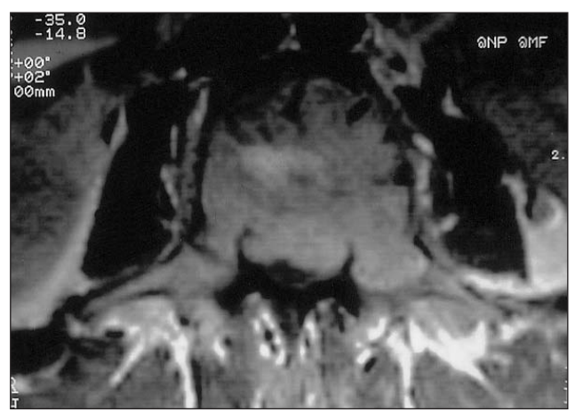
Figure 1. Contrast-enhanced axial T1-weighted MRI scan of the lumbar spine showing the narrowing of the spinal canal due to the extradural mass at L3 vertebral body and pedicles.

paraparesis. During surgery the L3 vertebral body was totally resected and a human femur allograft was inserted via the anterolateral approach. The L2-L4 spine was stabilized by spinal implants (Figure 3). Histological examination revealed a metastatic thyroid carcinoma with a predominantly follicular pattern (Figure 4). The patient then underwent total thyroidectomy and whole body iodine 131 (I-131) was administered for internal radiation. Histopathological examination of the thyroidectomy specimen also showed follicular carcinoma. Two weeks later, weakness of the lower extremity and