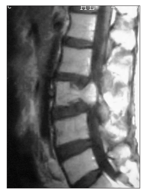
Figure 2. Contrast-enhanced sagittal T1-weighted MRI scan of the lumbar spine showing the L3 compression fracture due to the metastasis.