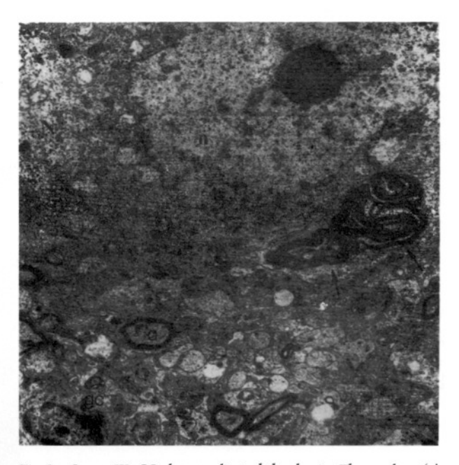
Fig. 2 : Group III. CO2 laser aplicated dog brain. The nucleus (n) and cytoplasmic organelles of the nerve cells (N) are seen normal structure. The large myelinated nerve fibers show separation of the myelin lamellae (arrows). Axon (a), glia cell (Gc) X 6600

Group IV: In general, the nuclei and cytoplasmic organelles of the nerve cells showed normal structure. Although small—sized nerve fibers revealed normal structure, large sized ones showed moderate