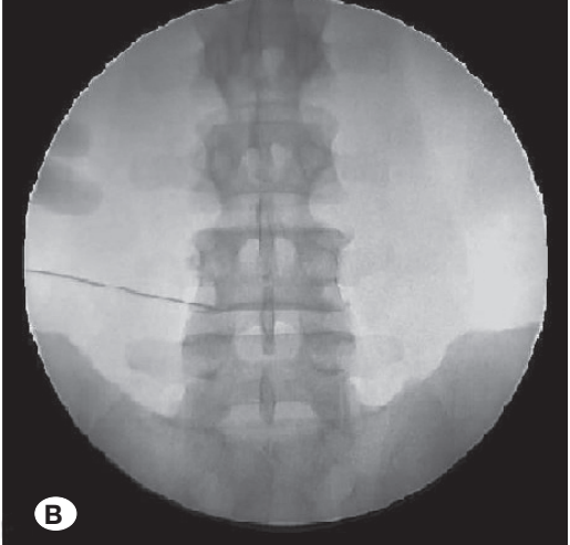
Figure 2: Lumbar transforaminal epidural steroid injection under C-arm guidance. A) Lateral view, B) anteroposterior view.