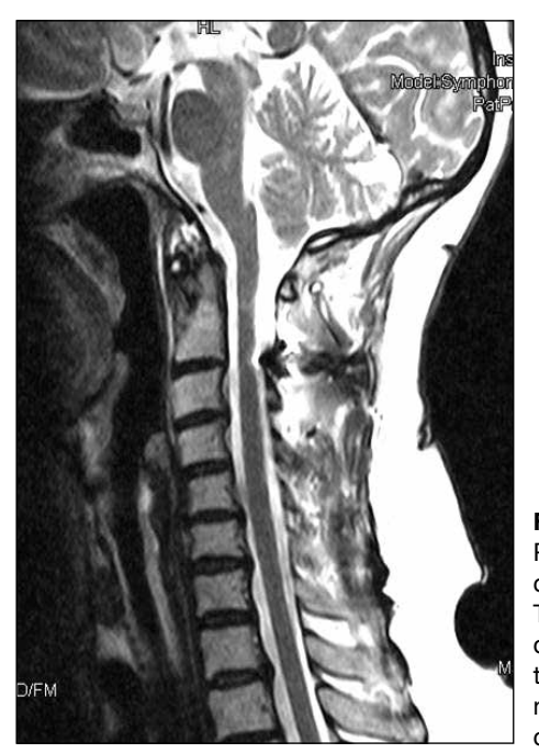
Figure 3: Postoperative cervical sagittal T2-weighted MRI demonstrates that there was no spinal cord compression.

to the previous ones, these rates are far from creating an adequate and safe fusion and the patients have to use rigid external orthoses that would affect their long-term life standards (36). Due to all these reasons, wiring methods are not frequently used nowadays.