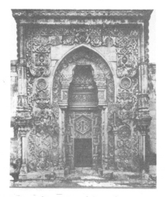
Fig. 1 : Entrance of Divriği Darüşşifa (Hospital)

herited from the Byzantine empire and some like Sivas daruşşifa were newly- established by the Selçuks. (founder: Turan Melik Hatun) (Figure-1) (13.16.17, 19.21). The decline of the Selçuk empire was very rapid. It was dissolved during the second half of the 13th century, giving place to several small regional states. One, the Ottoman state, was going to be the sole ruler of Anatolia and a very large part of Europe, Asia and Africa for the following six hundred years.