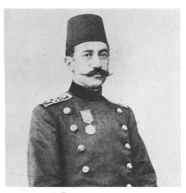
Fig. 2: Dr. Cemil Pasha