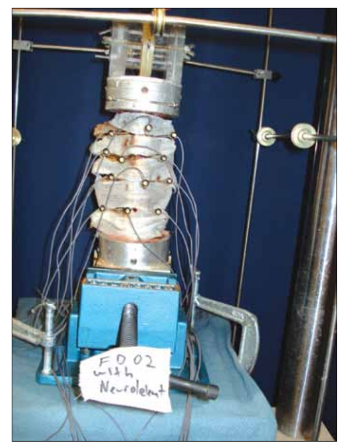
Figure 1: A representative specimen during biomechanics testing, optical markers for tracking motion are visible.

From the raw data, three parameters were generated from the quasistatic load-deformation data: angular ROM, lax zone (LZ, zone of ligamentous/soft tissue laxity), and stiff zone (SZ, zone of ligamentous/soft tissue stretching). The ROM can be divided into LZ and SZ, which thus are components of ROM. The LZ represents the low- stiffness portion of the typically biphasic load-deformation curve, while SZ represents the highstiffness portion (6). The LZ is similar to Panjabi's neutral zone,