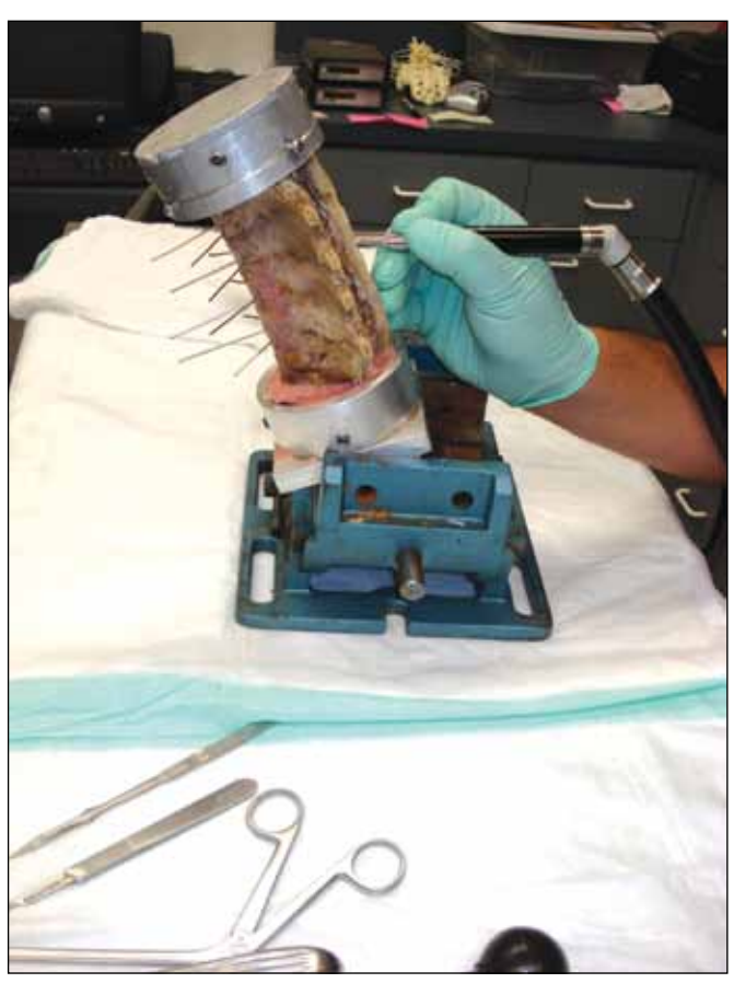
Figure 2: Photograph of surgical procedure.

which is defined as the zone in which there is only frictional joint resistance (12). LZ is more more reproducible and refers to the zone in which there is minimal ligamentous resistance (6). The location at which LZ crossed to SZ was calculated by extrapolating the load-deformation slope at data points