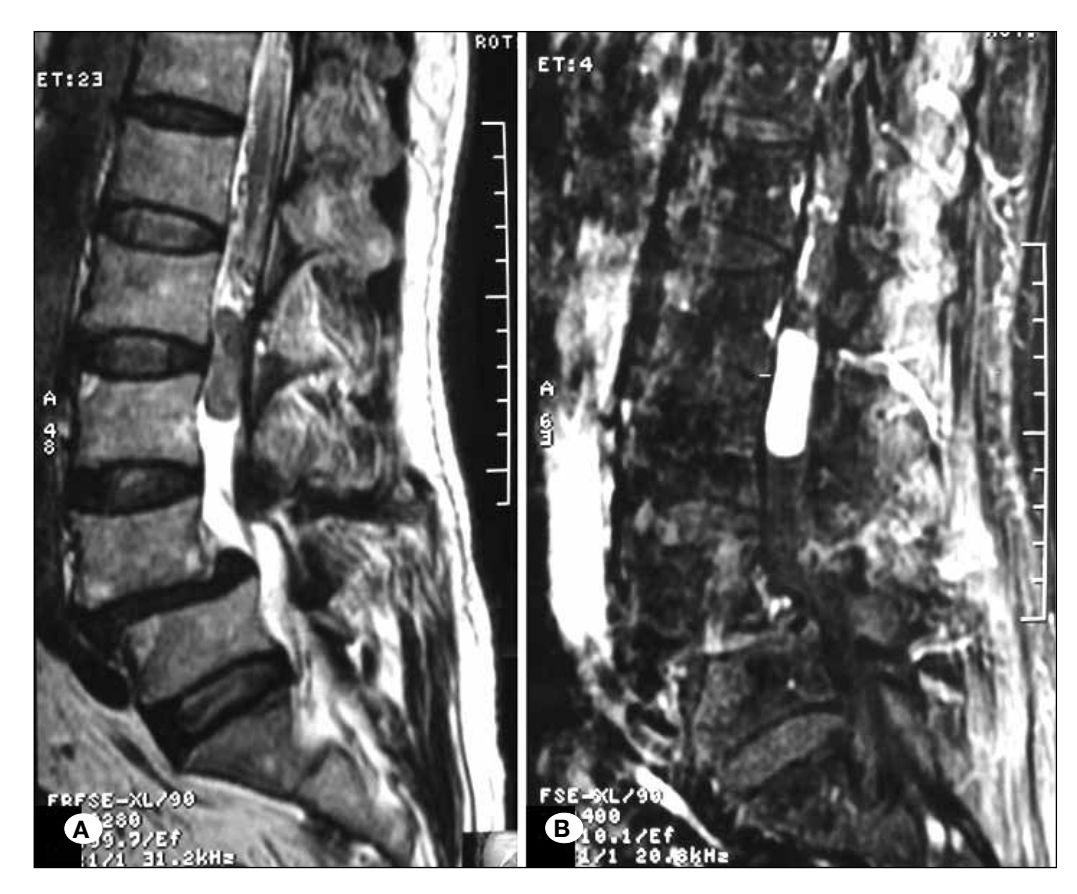
Figure 3: (Case 4) Magnetic Resonance Imaging A) Sagittal T1-Weighted image, showing a wellcircumscribed, intradural tumor isointense to the spinal cord in the spinal canal at the L2/L3 level.

NSE: Neuron-specific enolase, Nf: Neurofilament proteins, EMA: Epithelial membrane antigen.