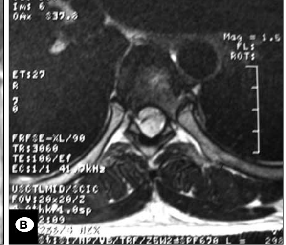
Figure 1: (Case 1) Magnetic Resonance Imaging A) T2weighted sagittal image, showing a well circumscribed, homogeneously enhancing extradural tumor filling the spinal canal at the T6-7 level. B) Axial T2-weighted image, showing the mass lesion displaced the cord to the front of the spinal canal.

The best-known type of paraganglioma is the pheochromocytoma, which secretes catecholamines and leads to labile hypertension. Although all paraganglia sequester catecholamines in cytoplasmic granules, paragangliomas arising from non-adrenal tissue are rarely active in neuroendocrine production (10). Only a few cases of spinal paraganglioma have been