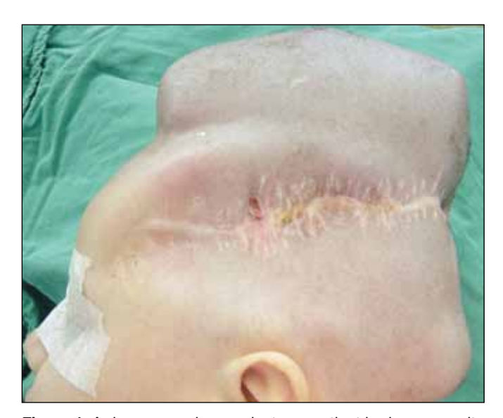
Figure 1: A decompressive craniectomy patient had a composite defect involving skin for which tissue expansion was carried out.

Patient's head was positioned laterally on a silicone headrest under general anesthesia leaving craniectomy defect up. Scalp was prepared with povidon-iodine solution and draped properly. A 4 cm long oblique incision was made 4-5 cm posterior and superior to the posterior border of craniectomy incision line, and then the galea was dissected from periosteum. A tissue expander prefilled with 20 ml saline and its pump was placed underneath scalp and propelled to vertex. The procedure was completed following skin closure. Patients were assessed weekly in outpatient clinic for threemonths and the pump was filled with additional 20 ml saline on each visit (Figure 1).