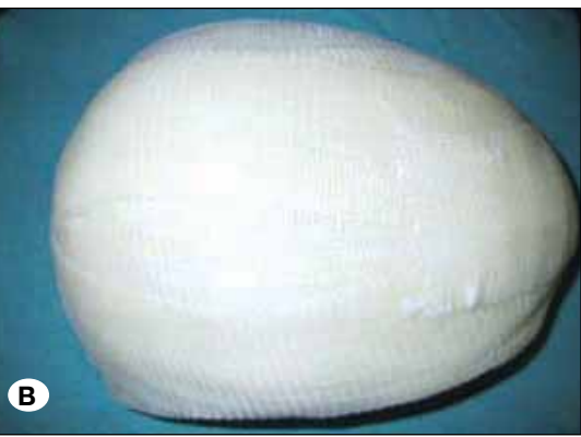
Figure 2: Plaster cast widely used in orthopedic surgery was prepared as a mold. A) Lateral view. B) Top view.