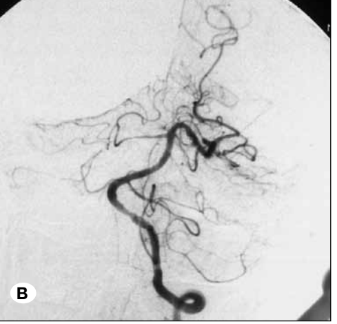
Figure 3: A 40-year-old woman suffered a Hunt-Hess grade III SAH. A) Injection of the left vertebral artery outlines a wide-necked PCA-P1 aneurysm. The aneurysm was treated by Neuroform stent-assisted coiling. B) The post-treatment angiogram showed complete occlusion of the aneurysm.