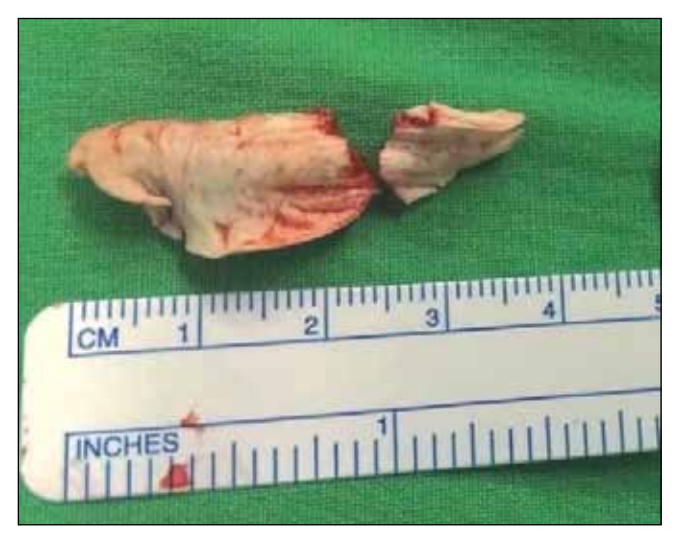
Figure 3: The irregular shaped, 3.5 cm long intradural PMMA cement collection.