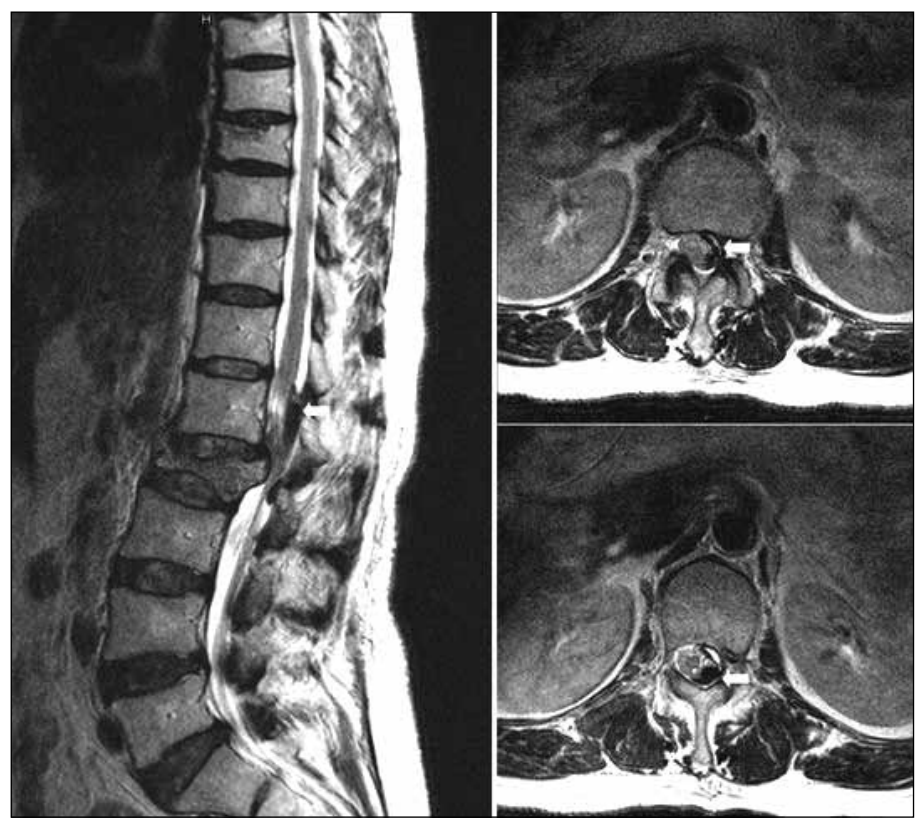
Figure 2: Sagittal and axial T2-weighed images reveal one hypointense intradural extramedullary mass lesion (white arrow) causing cord displacement and edema.