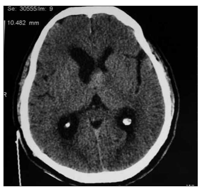
Figure 1: Preoperative CT scan is showing the isodense lesion in the third ventricle and ventricular dilatation.

The most common tumors that cause a cerebral and cerebellar metastasis are lung, breast and skin cancer (2, 5, 6). However, the frequency of the primary tumors causing a ventricle metastasis is different. Our literature review showed that the most common cause of the ventricle metastasis was renal cell carcinoma (RCC) of the kidney followed by lung, colon and thyroid carcinomas.