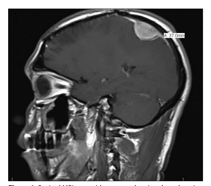
Figure 1: Sagittal MRI scan with contrast showing the enhancing lesion and the dural tail.

With this background a panel of immunohistochemistry was done to reach the final diagnosis. EMA and PR were negative, and this along with the lack of typical meningothelial nodules even after examining the entire tissue ruled out the diagnosis of meningioma.