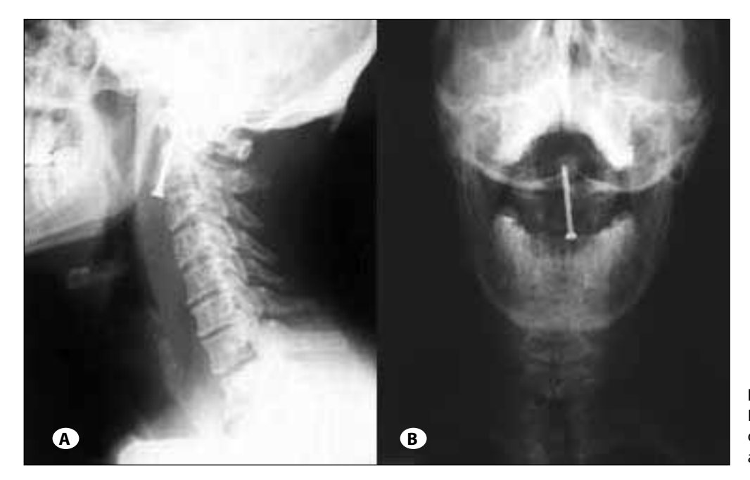
Figure 4: A) Lateral and B) anteroposterior x-ray of an odontoid fracture fixed with a screw.

Richter et al. compared 4 different orthosis types in their biomechanical study they performed on fresh cadavers, and stated that a Halo brace provided a more rigid fixation in