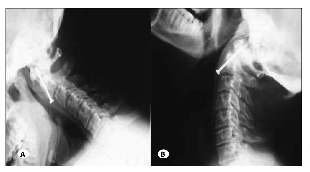
Figure 5: Lateral A) flexion, B) extension radiographs 9 months after the operation.