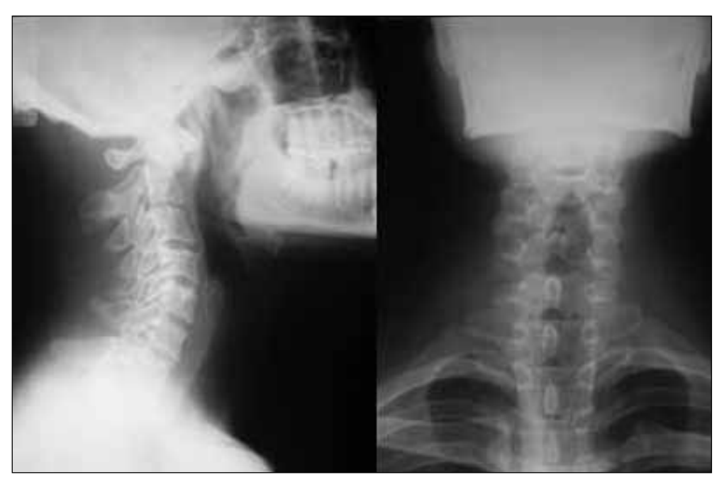
Figure 1: Preoperative cervical spine x-ray showing Type II odontoid fracture.

The mean age of the patients in the study was 43.75 (between 16 and 78) years and the male/female ratio was 19/12. The mechanism of injury was as follows: 23 cases due to traffic