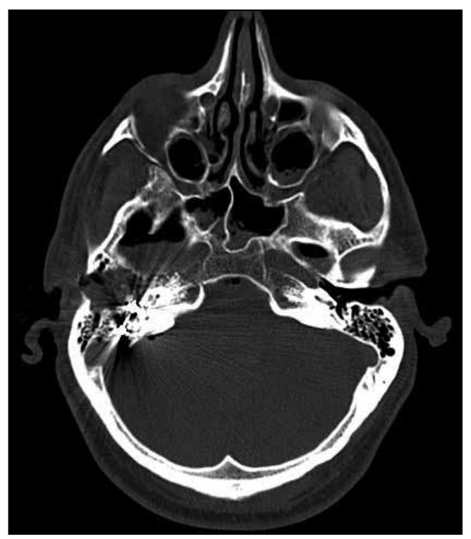
Figure 1: Preoperative CT scan.

A 45-year-old man who was injured in suicide attempts with a gun was carried to the emergency room of our hospital. On observation, it was possible to pick out the bullet entrance hole which shaped the round form in front of the right tragus with otorrhagia and otoliquorrhea right anacusia and total