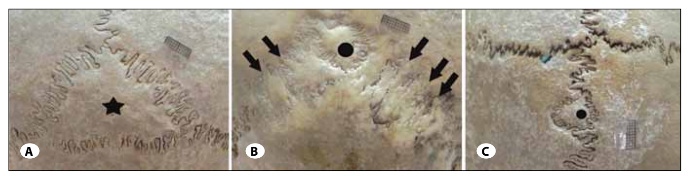
Figure 1: The different typology wormian bones in the posterior fontanelle. A) single preinterparietal, B) both preinterparietal and multiple sutural bones, C) interparietal bone.