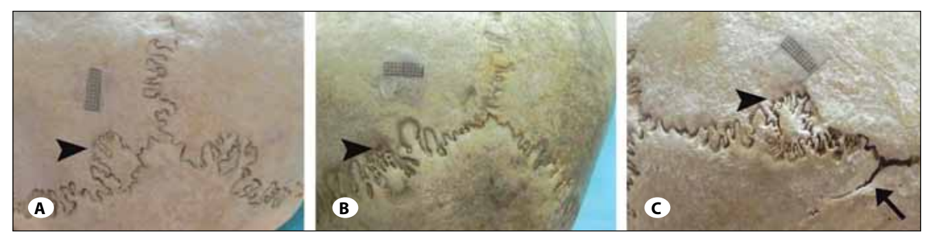
Figure 2: Examples of sutural bones in lambdoid suture A) heart shaped, B) round, C) stamp shaped.