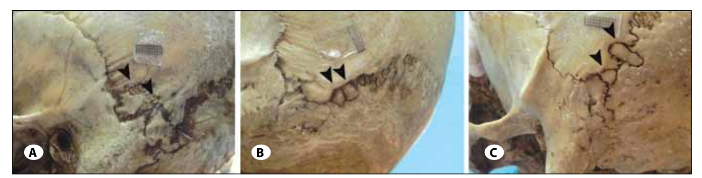
Figure 3: Multiple sutural bones in lambdoid suture. A) sides jagged, B) side by side, C) intermittent.