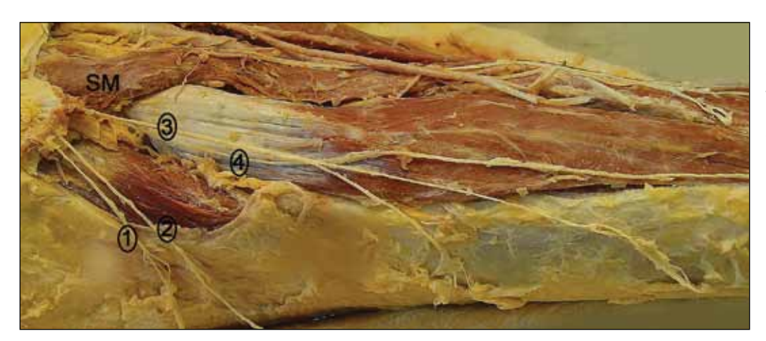
Figure 3: Distribution of the four nerve branches. The posterior (1) and anterior (2) branches of the posterior LFCN branch was distributed to the supero-lateral aspect of the thigh, while the lateral (3) and medial (4) branches of the anterior LFCN branch supplied the extended anterolateral aspect. (5M: Sartorius Muscle).

sartorius muscle laterally in 64.5% (12). Origin of the LFCN from the femoral nerve has been noticed in 6% (1) to 10% (13) of the studied cases, whereas there is a documented case in which the LFCN was found arising from the femoral nerve, although the origin occurred below the level of the IL (3). In all these cases, the LFCNs were exclusively provided by the femoral nerve, while in our case, two LFCN branches were present. To our best knowledge, we were able to detect one similar case in the literature, in which an accessory LFCN branch was found arising from the femoral nerve in the pelvis (15). We should mention however that in the aforementioned case the supernumerary nerve had a subservient role, as it terminated early, after supplying the supero-anterior aspect of the thigh (15), whereas in our case the LFCN branch originating from the femoral nerve was not characterized as an accessory nerve branch due to its extended length and distribution.