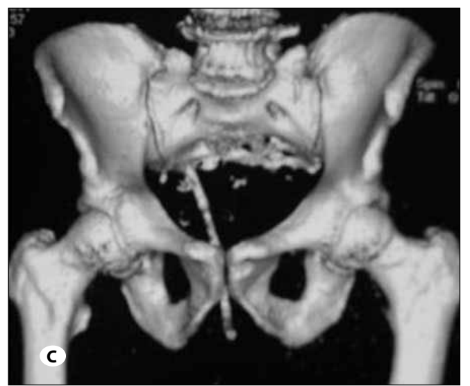
Figure 1: Imaging shows sacrococcygeal chordoma ( A ), chordoma involving the craniovertebral junction ( B ) and post-tumor resection CT scan of the sacrum and pelvis ( C ).