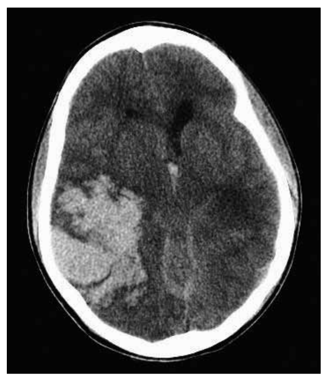
Figure 2: Computed tomographic (CT) image, axial cut of the patient showing a massive intraparenchymal hemorrhage in the right hemisphere.