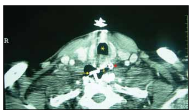
Figure 2: Preoperative thoracal CT. Yellow arrow; screw, *; trachea, E; pharynx, red arrow head; nasogastric tube.