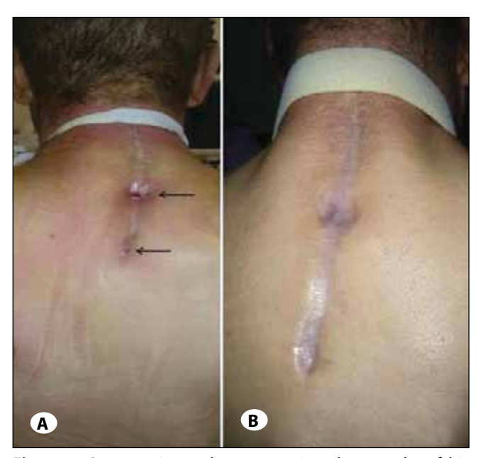
Figure 1: Preoperative and postoperative photographs of his back. A) Two interscapular fistulas on his back (black arrow). B) Three weeks after the surgery; postoperative improvement.