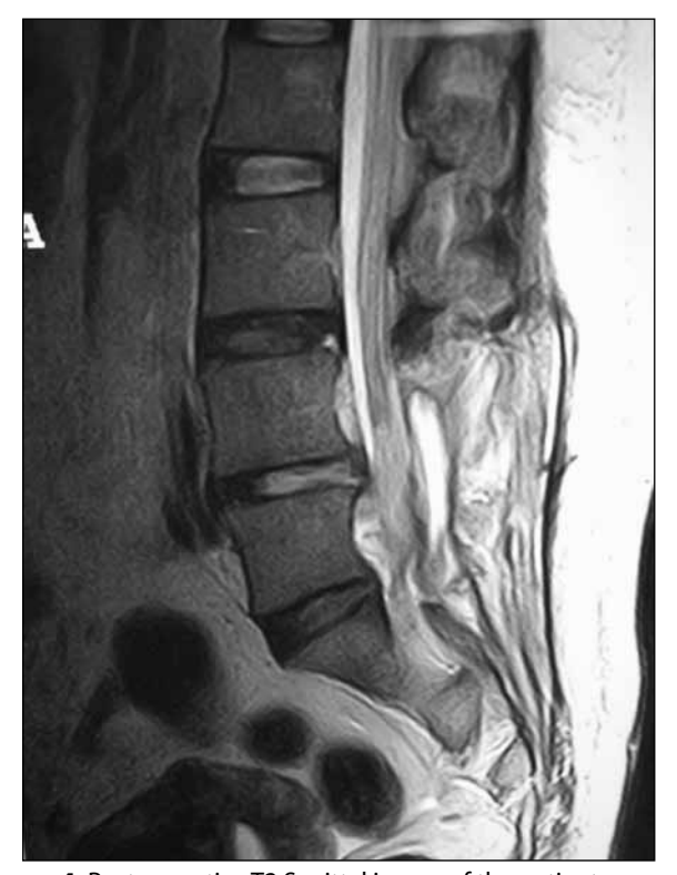
Figure 4: Post operative T2 Sagittal image of the patient.