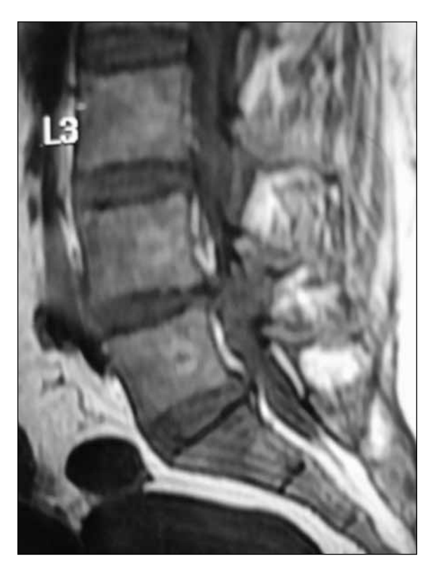
Figure 2: T1 sagittal MRI image showing disc herniation at L4-L5 level.