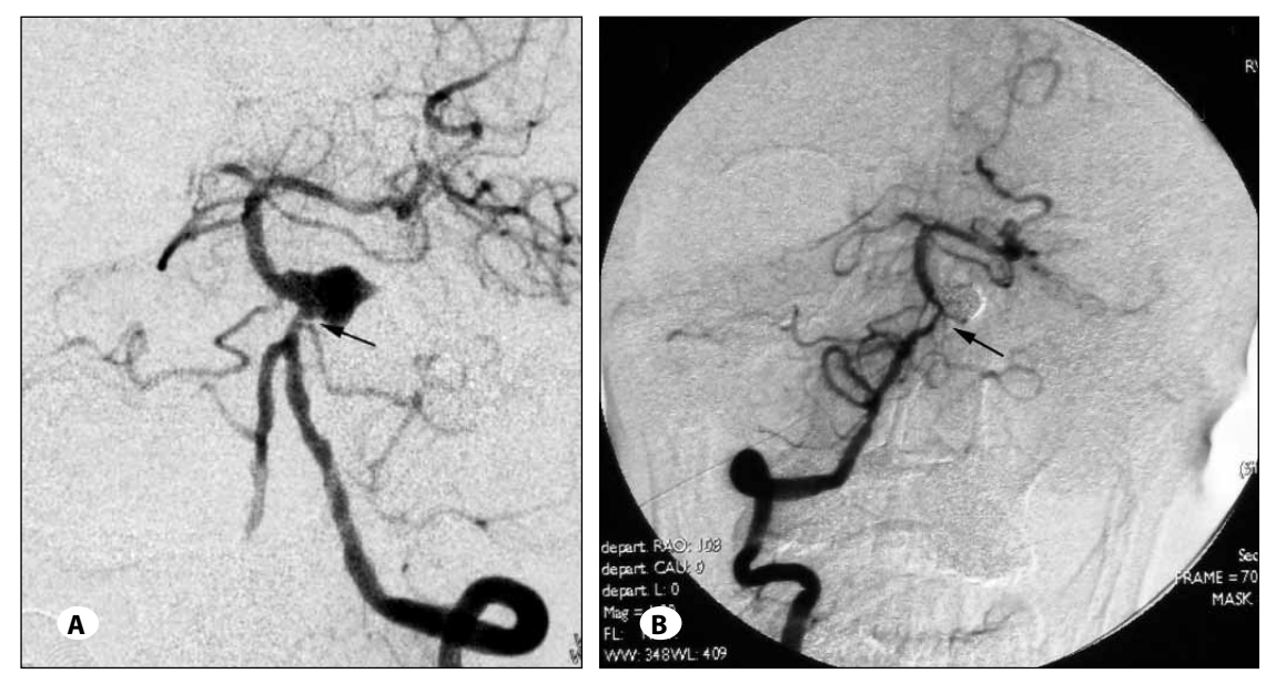
Figure 2: A) Left vertebral angiogram in a frontal view shows a dissecting aneurysm of the basilar trunk at the AICA with the area of dissection (arrow); note the AICA originating within the involved segment. B) Right vertebral angiogram in a frontal view after treatment shows the aneurysm is stented (Enterprise stent, 4.5×28-mm) and coiled completely. The AICA was preserved(arrow). Follow-up angiography at 10 months (not shown) shows no coil compaction or aneurysm regrowth.